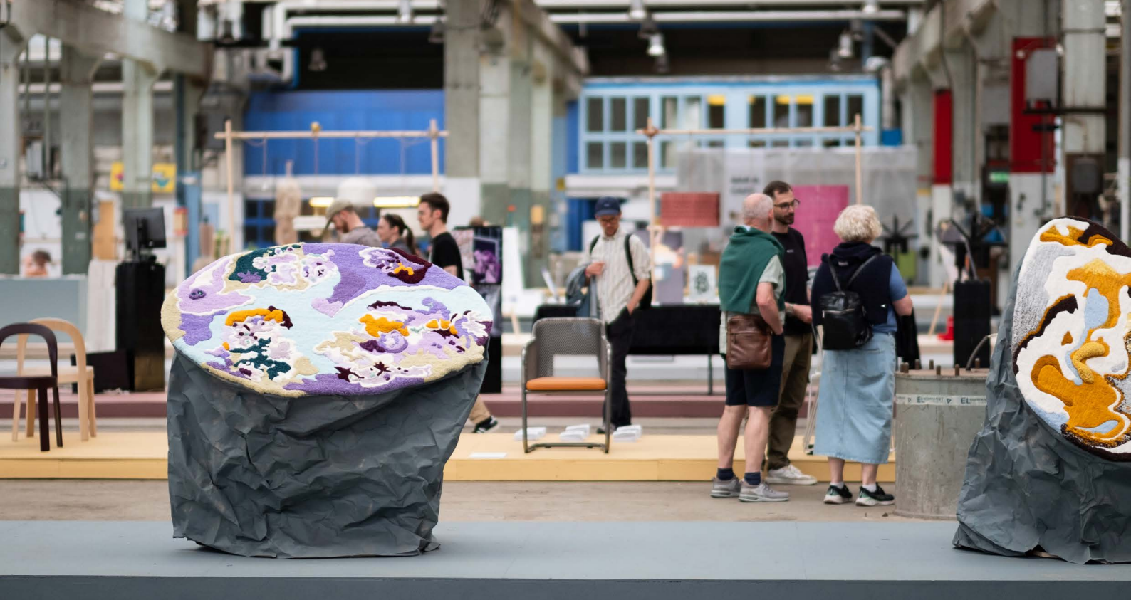
EXHIBIT AT THE MAIN LOCATION

Lokstallarna in Kirseberg hosts selected exhibitions connected to this year's theme, "ECHO," and SSDD's overarching focus areas: Sustainability, Collaboration, Development, and Innovation. We welcome design studios, design collectives, as well as larger companies and organizations to apply for an exhibition space at Lokstallarna.