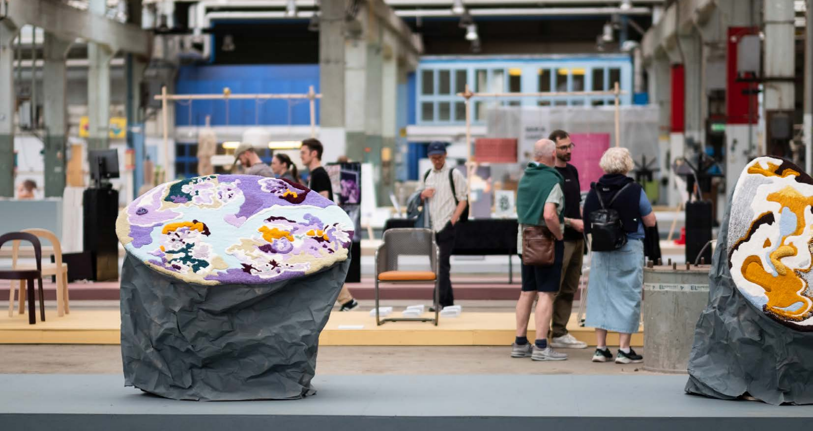
EXHIBIT AT THE MAIN LOCATION

Lokstallarna in Kirseberg hosts selected exhibitions connected to this year's theme, "ECHO," and SSDD's overarching focus areas: Sustainability, Collaboration, Development, and Innovation. We welcome design studios, design collectives, as well as larger companies and organizations to apply for an exhibition space at Lokstallarna.